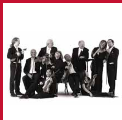
The Second Violins

We are considering arranging a wildflower walk in Kings Park prior to the event. When booking for Celebrating Second Fiddles please indicate on the booking form whether you would be interested in participating in a walk. If there is enough interest we will contact you to advise further details.