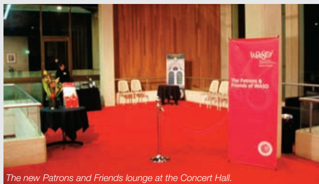
The new Patrons and Friends lounge at the Concert Hall.

Drinks and coffee are available at normal prices in a relaxed atmosphere and without the need to queue for service. Members of the Patrons and Friends Committee will be present to welcome you and your friends, with guests especially welcome – perhaps as potential members! Speakers have been installed to allow you to listen to the pre-concert talk. The Patrons and Friends lounge is on the third level above the Concert Hall foyer. Take the lift if you don't like the stairs!