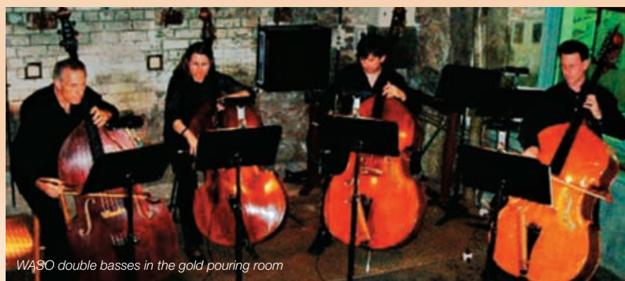
WASO double basses in the gold pouring room